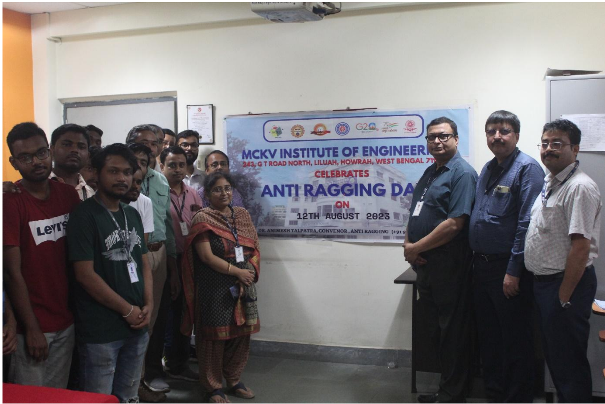
Anti-Ragging Day Celebration