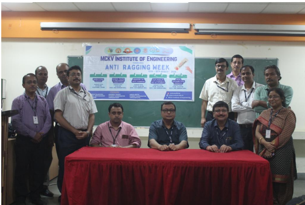
Seminar on 16 th August, 2023