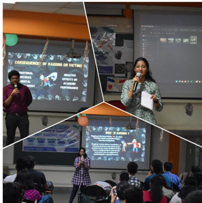
Anti-Ragging Week Celebration