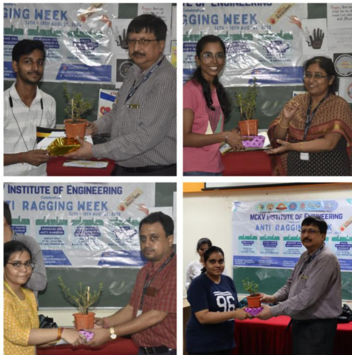
Prize Distribution on 18th August , 2023