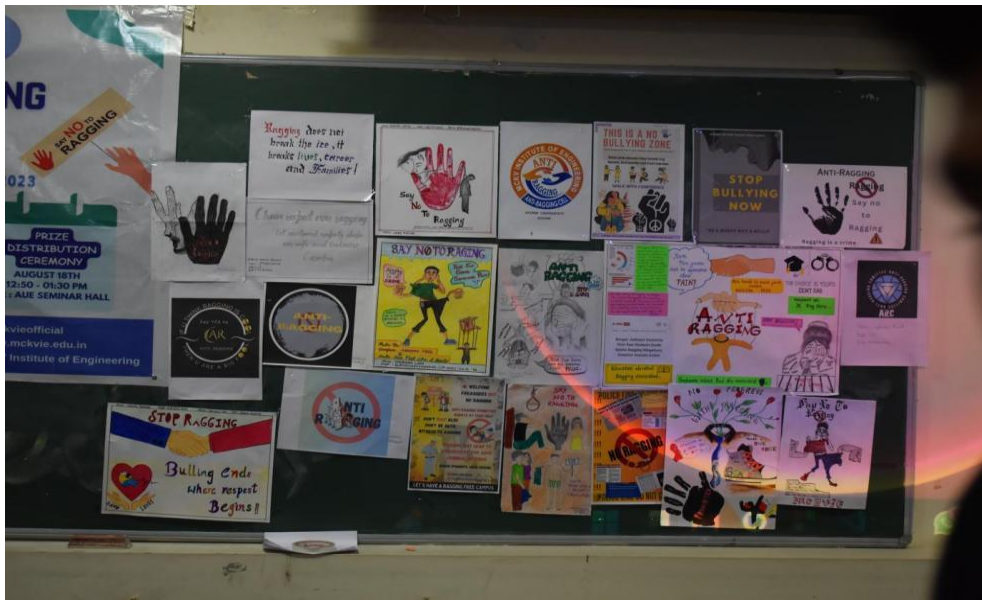
Submissions of the Competition